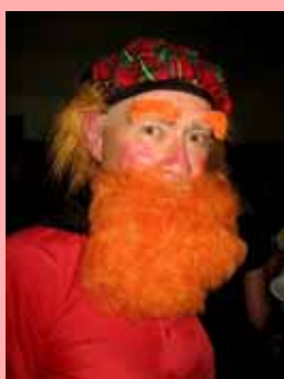
Tam o' Shanter comes alive. But who is behind the beard? Answer on another page.