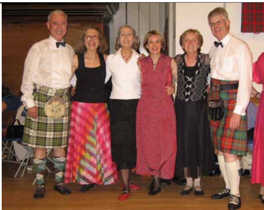
A happy contingent of French dancers come to share Christmas with London Branch

Admission £7.50 members, £8.50 non members, £2.00 Children, members' children admitted free.