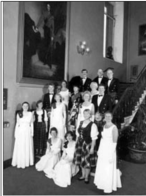
The Dem Team, September 2000 at Royal Albert Hall